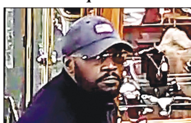
The Hiawassee Police Department is looking for this man who was allegedly caught on tape stealing jewelry from the Hiawassee Antique Mall on Nov. 7.